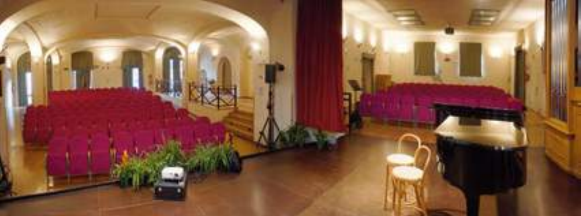
Collegio Gallarini Conservatorio Guido Cantelli Novara